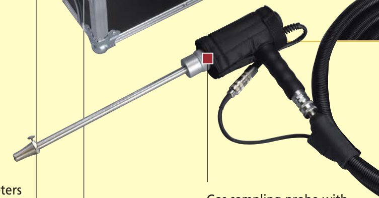
Gas sampling probe with heated grip and temperature regulated quartz glass wool filter